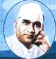
Karmaveer Bhasaheb Hiray